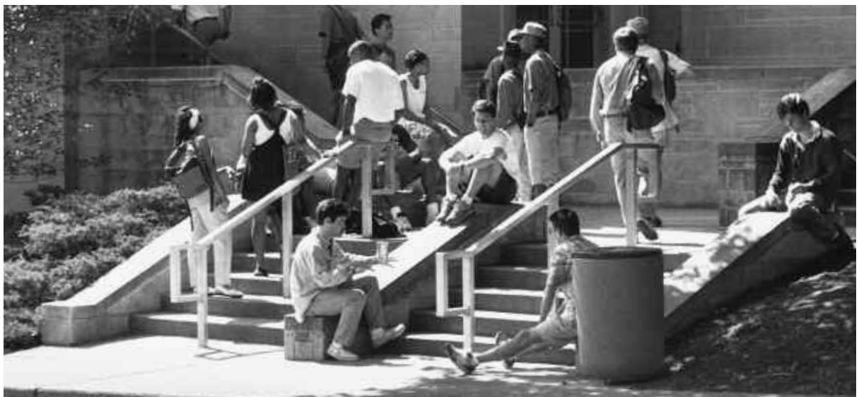
Students relax between classes at Ballantine Hall.

Academic records of UD students are reviewed at the end of each term. Determination of academic status is based upon all credit hours (transfer and IU graded hours) and IU cumulative GPA. "Graded hours" include credit hours for courses completed with a grade of F, but do not include credit hours earned with a grade of P or S.