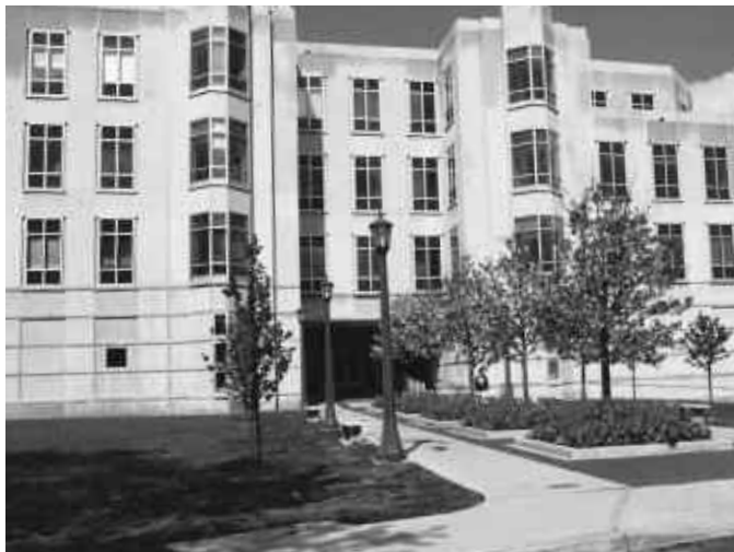
School of Education, Wright Education Building, Rose Avenue and Seventh Street

Theatre secondary program (College of Arts and Sciences)