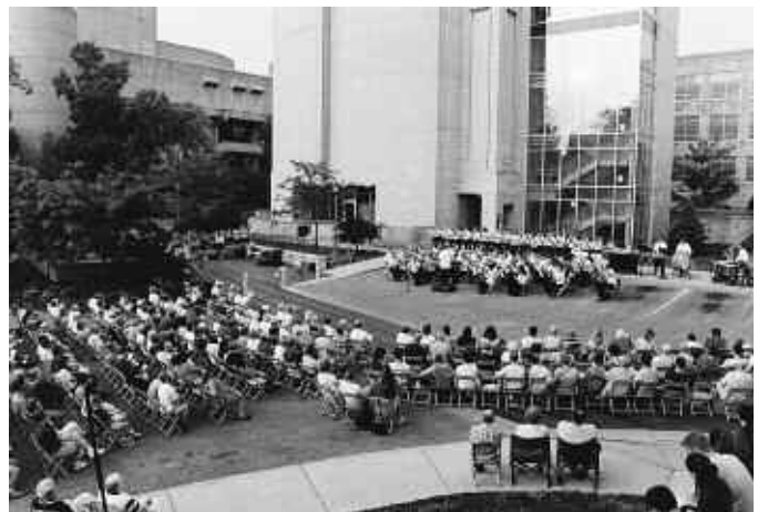
Summer band concert at the Jacobs School of Music.

For information regarding admission and degree requirements for String Instrument Technology, contact the Jacobs School of Music.