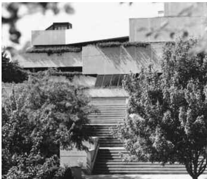
School of Public and Environmental Affairs, Tenth Street

Admission to the School of Public and Environmental Affairs is competitive. To be considered for admission, students must complete at least 26 credit hours, but no more than 75 credit hours. Applicants must complete an introductory SPEA course (V 160, V 161, E 162, or E 272) with a grade of C or higher. Admissions decisions are based on several factors, including the student's cumulative GPA, grade trends, and SPEA course GPA. Application deadlines are May 1 for fall admission and December 1 for spring admission.