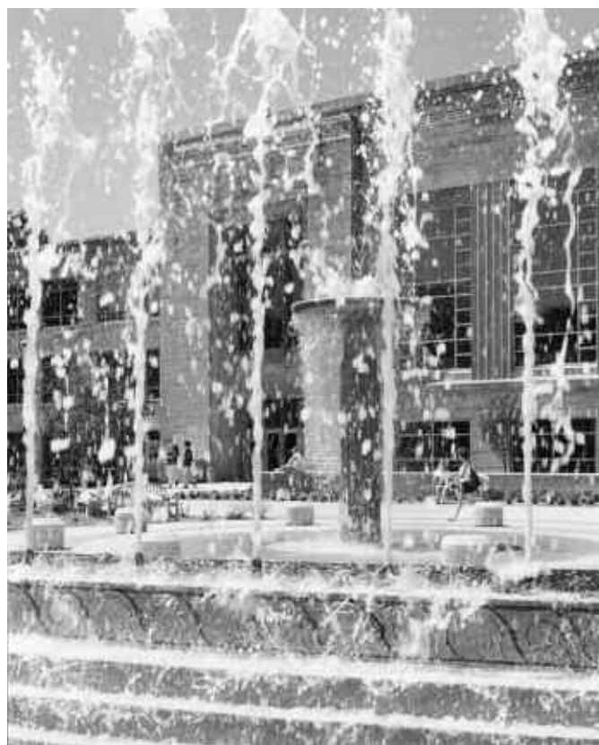
Music Library, North Jordan Avenue

Credits in music theory earned through the Advanced Placement Program or transferred from other universities must be validated by examinations before they can be used to meet degree requirements.