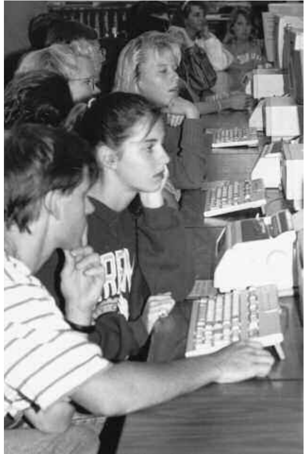
Students develop computer skills.

The Division of Labor Studies is being reorganized. Consult with your advisor.