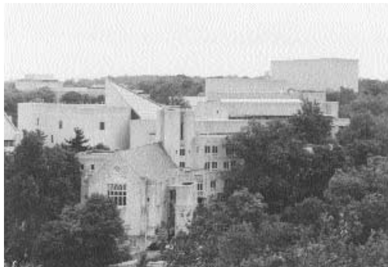
Indiana University Bloomington