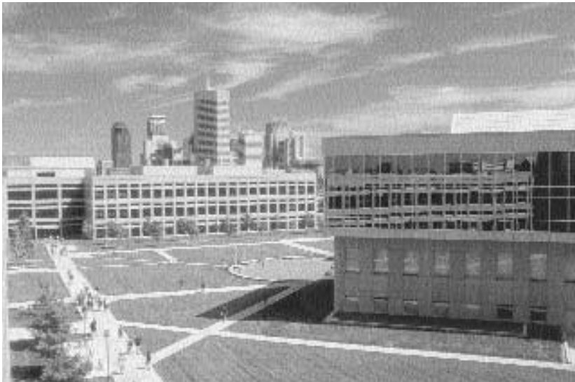
Indiana University–Purdue University Indianapolis

INDIANA UNIVERSITY BULLETIN OFFICIAL SERIES (USPS 262440) ISSN 0-888-5338